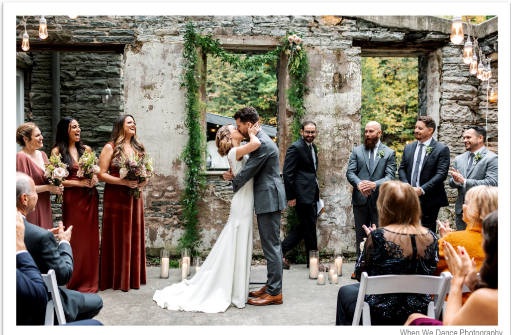
when we Dance Photography